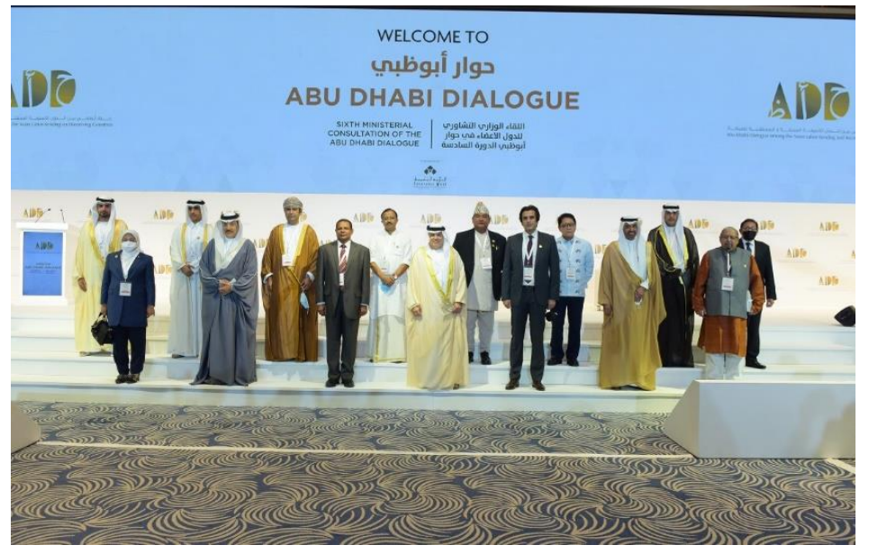
Ministers and senior officials from 16 GCC and Asian states attended the high-level regional summit on labour and migration, the Sixth Ministerial Consultation of the ADD.

The Abu Dhabi Dialogue was established in 2008 as a forum for dialogue and cooperation among Asian countries of labour origin and destination. The ADD consists of 18 countries, 11 countries of origin: Afghanistan, Bangladesh, China, India, Indo nesia, Nepal, Pakistan, The Philippines, Sri Lanka, Thailand, and Vietnam; and 7 countries of destination: six GCC countries of destination (Bahrain, Kuwait, Oman, Qatar, Saudi Arabia, and the United Arab Emirates), and Malaysia. It has special significance for the South Asian countries--including Nepal--as GCC is the major destination for most of the migrant workers from the region.